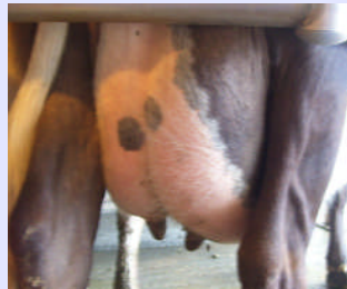
Swollen right rear quarter, indicative of mastitis

Treatment did not significantly affect ( p > 0.05 ) subsequent milk production for cows or heifers.