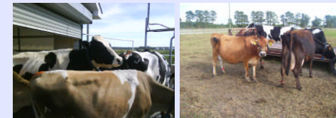
Holstein, Jersey and crossbred cattle at Cherry Research Farm

a,b,c values with different superscripts (within a row) differ significantly ( p < 0.05 )